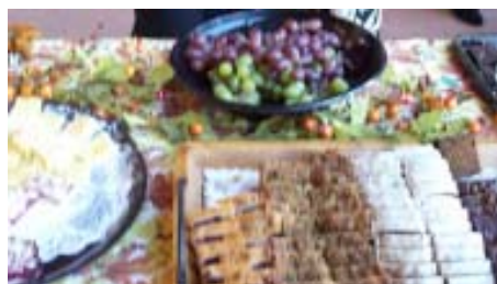
Another dazzling array of goodies!