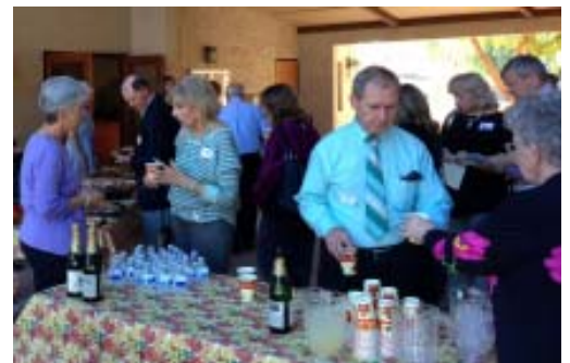
Re-connecting with wonderful friends