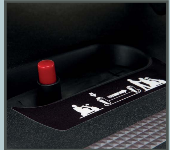
Two-Step Brake Disengagement Lever Prevents the accidental release out of drive mode.