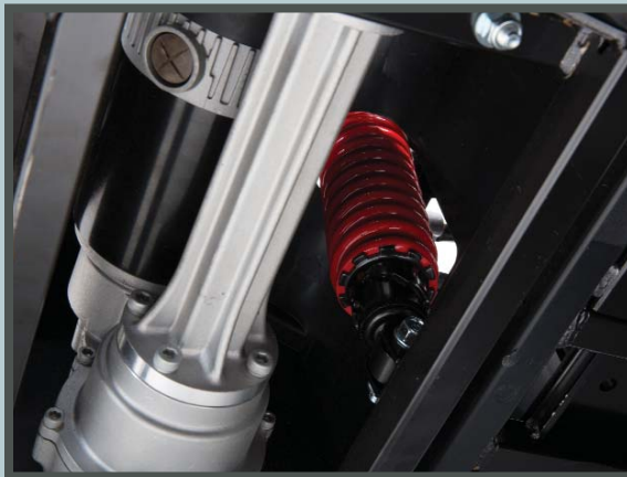
Reliable Components The redesigned motor and gearbox have been extensively tested for reliability and durability.