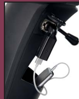
USB Charger Port