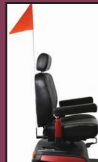
6' Safety Flag