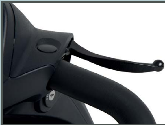
Manual Hand Brake A secondary brake which immediately engages the scooters' braking system in case of an emergency.