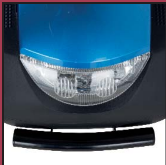
Front and Rear Steel Bumpers