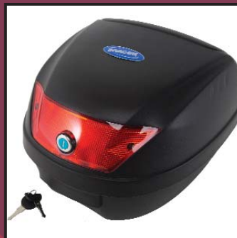
Rear Storage Box