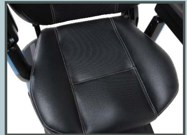
Superior Materials The padded vinyl seat with sport-accent stitching is long-lasting and easily cleanable.