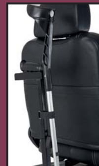
Forearm Crutch & Cane Holder