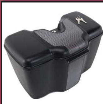
Front Lock Box