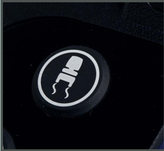
Speed Reduction Technology - SRT Maintain optimal control of your scooter with SRT which slows the unit while cornering.