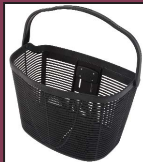
Extra Large Front Basket