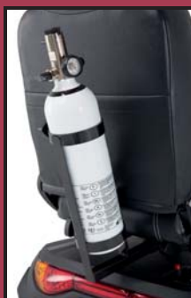
Oxygen Tank Holder