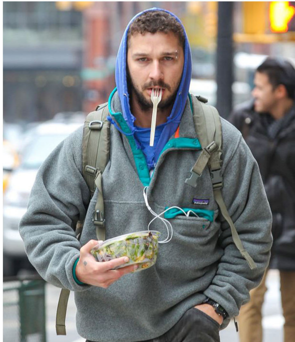
Shia LaBeouf, Week 1 Celebrity Host

High concept, big food,... can you say, "Curb Salad?"