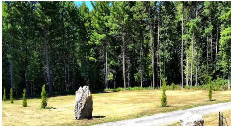
Natural Burial Section at Rosendale Plains Cemetery