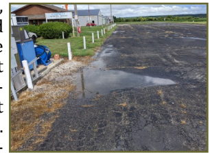
Airport Taxiway - Before

It has been a busy Fall at the airport! The fueling apron project got underway and after several setbacks, it is almost complete. The contractors got all the site work, concrete placed, and asphalt laid down and they will be finishing the final dirt work and cleanup soon. It looks very nice and is a great improvement as the previous apron asphalt had mostly turned to black gravel. They also milled and replaced the asphalt on the taxiway and replaced or sealed the cracked areas on the actual runway. All these projects were either completely paid for by the FAA or at most a 10 percent city share on the small repairs.