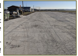
Airport Taxiway - After