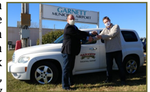
AuBurn Pharmacy donates courtesy car