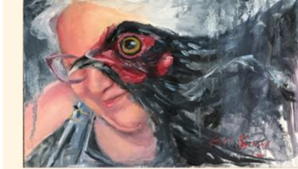
carol berning fine art