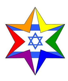
Everyone is Welcome