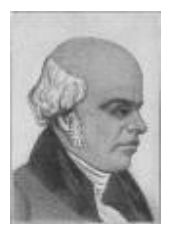
(A.M.E. Zion from page 8)

Beginning with -& few members, it now numbers its members by the hundreds of thousands, and is an important factor in the pursuit of the work of the Christian religion among the inhabitants of the earth.