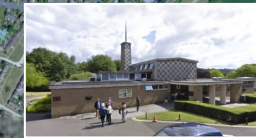
Salisbury Crematorium FACE OF ALA-LU