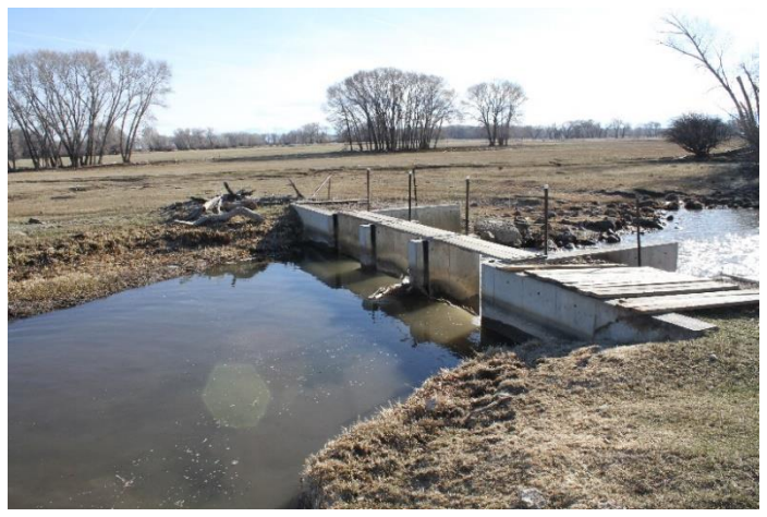
Diversion dam (Consolidated Slough Weir)