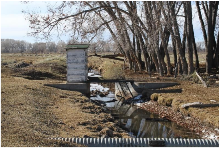
Ditch downstream of headgate