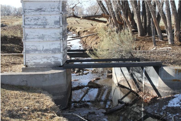
Flume looking downstream