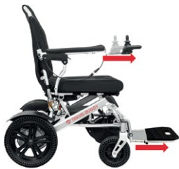
Extendable joystick and footrest for up to 5" of extra length.

Our Travel Buggy electric wheelchairs are intuitive to drive and friendly to manage.