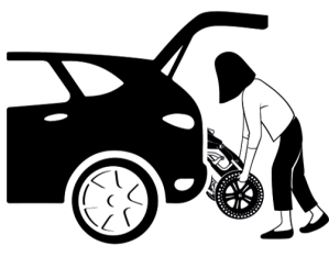
FITS ANY VEHICLE