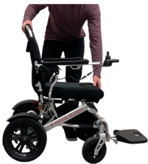
1-STEP FOLD SEQUENCE

Folds quickly like a lawn chair to the size of a suitcase for convenience transport in any vehicle or storage.