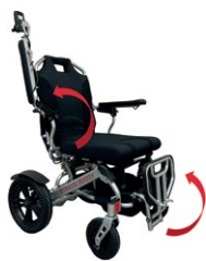
Fold-away footrest and lift-up armrests for safe front or side entry.