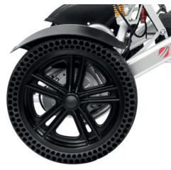
Shock absorbing wheels with hundreds of perforations to absorb the vibrations.