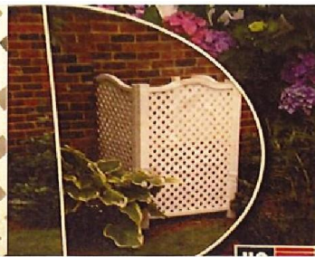
Enclo Privacy Screens Wilmington No Dig 2 Panels 36-in W x 48-in H White Vinyl/Polyresin Outdoor Privacy Screen Item #3610617 Model #ZP19008