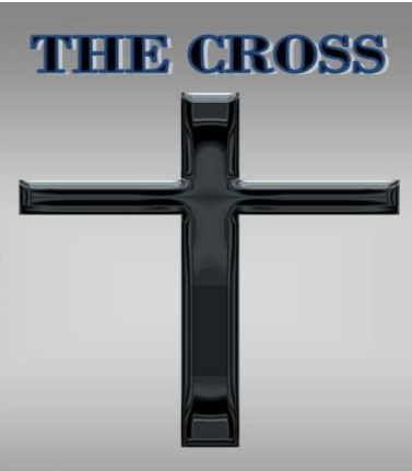
A CHURCH WHERE EVERYBODY IS SOMEBODY AND CHRIST IS LORD OF ALL"