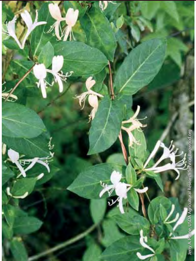
Jerry A. Payne, USDA Agricultural Research Service, Bugwood.org

Japanese honeysuckle spreads along the ground, forming dense mats and climbs shrubs and trees, often dominating tree canopies. Young stems are brownish-red and usually have soft, fine hairs, while older stems are woody with bark that peels in long strips. Opposite, oval leaves grow up to 3 inches long and remain on the vine until mid-winter. Fragrant white flowers turn yellow with age and occur in pairs at the leaf axil (where the leaf attaches to the stem). Petals are fused, forming a tubular flower. Flowers bloom from May through June; developing small, purplish-black fruits containing 2 to 3 seeds that persist into late winter.