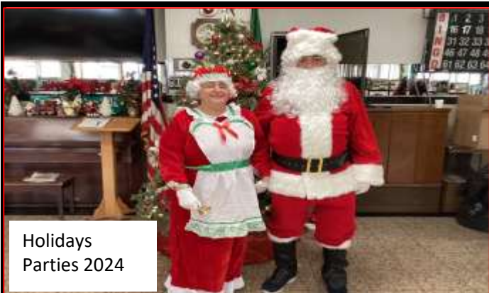
Holidays Parties 2024

Referrals and information available in our office! Stop in if you have questions regarding entitlements, benefits, or resources!