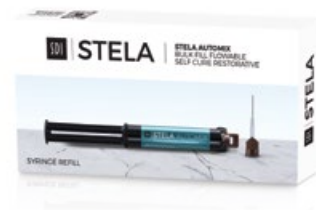
STELA AUTOMIX REFILL - 8640001 1 x 8g SYR, 15 mixing tips