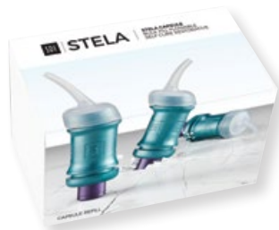
STELA CAPSULE REFILL KIT - 8640003 50 x Stela Capsules