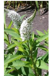
GOOSE NECK - partial shade