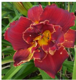
DAYLILY highland lord