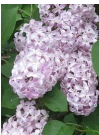
LILAC - full sun