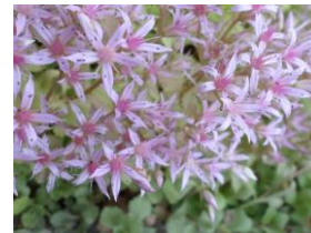
SEDUM groundcover pink - full sun