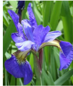
SIBERIAN IRIS medium purple