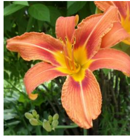
DAY LILY orange 38" – early-full sun