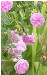
WEBSTER HOUSE Late - full sun