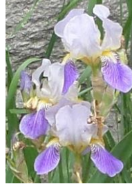
BEARDED IRIS light purple - full sun