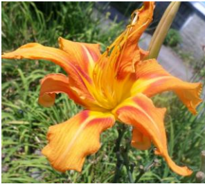
DAY LILY orange ruffled double 48" – late summer