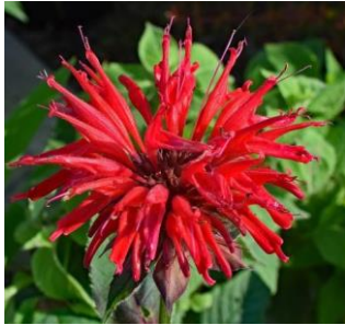
BEE BALM full sun-partial shade