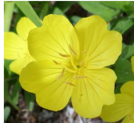
PRIMROSE yellow - full sun