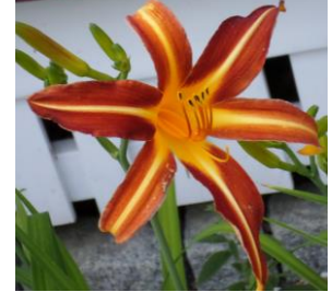
DAY LILY marse tall - full sun