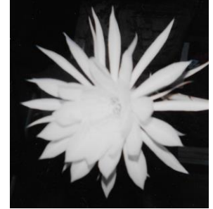
QUEEN of the night outside summer only