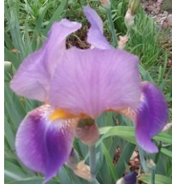
BEARDED IRIS purple - full sun