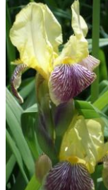
BEARDED IRIS yellow, short