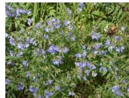
JACOB'S Ladder - full sun-partial shade