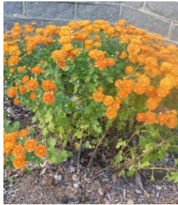
MUM orange full sun-partial shade