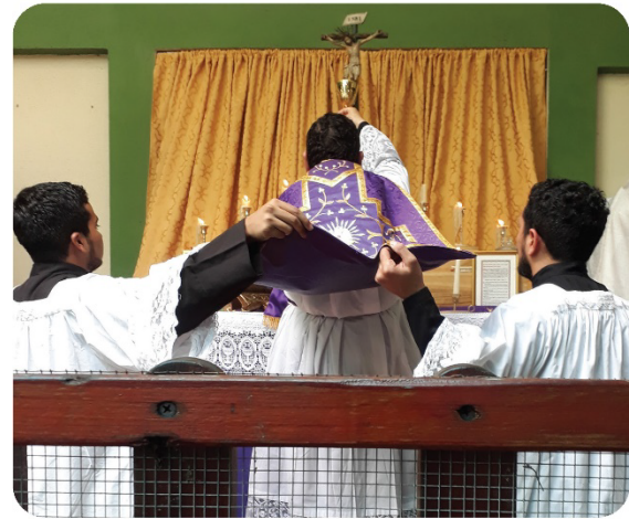
PROFESANT / CATHOPIC

All that being said, to those who enjoy socializing or who must leave the Mass before the final note of the final hymn: do be considerate of those praying near you. They might be praying for you! ●