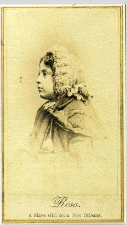
A Little Enslaved Girl

Despite the declaration in the 1787 Constitution that blacks are only "3/5ths of a person," up pops a prodigy like young Phyllis Wheatley to make a liar of the inferiority claim.