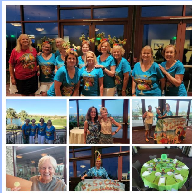
More happy faces!

Come join us in the desert next year . . . 2023 dates and location to be announced soon!