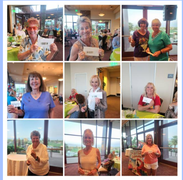
And more winners!