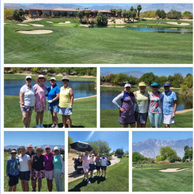
Day 1 on Desert Willow Firecliff Course

Fantastic golf experiences, great camaraderie, fun banquet, lots of raffle prize winners, and lots of beautiful smiles. Photos are also posted on the SDCWGA Facebook page and will be available on the SDCWGA website .