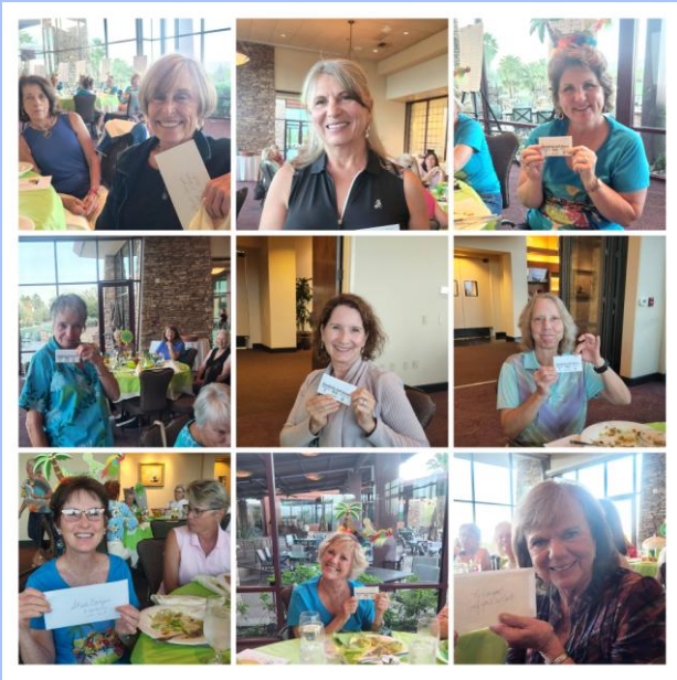
More happy raffle winners!