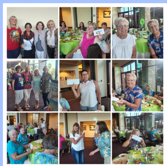
Skins & Raffle Winners