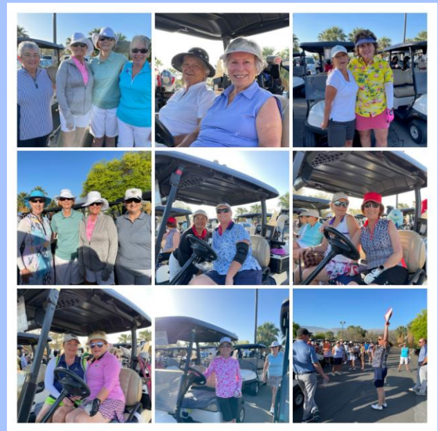
Day 2 - Desert Willow Mountain View Course