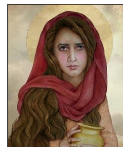
Feast Day: July 22