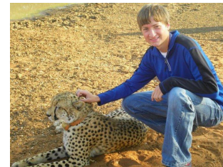
South Africa (2010)

He also attended five PTPI Global Youth Forums in Chicago, Denver, Atlanta, Kansas City, and Washington DC from 2006-2010 attending with members from the Sheboygan Chapter.