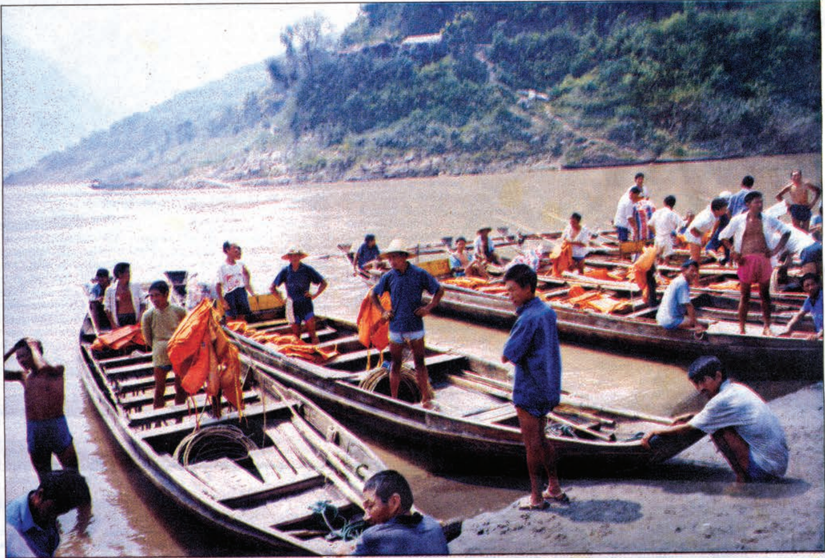
A crew of six or seven accompanies up to 10 passengers in each of the wooden pea-pod boats.

A single misstep, a snapped hawser or a pilot's faulty judgment