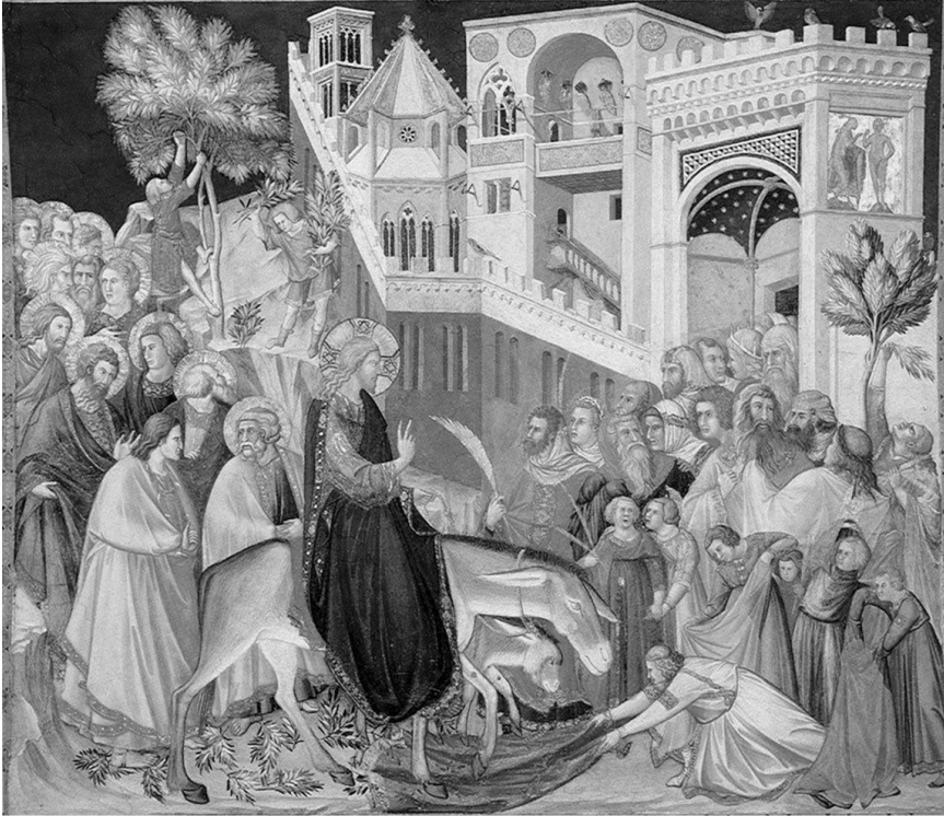
Christ's Entry into Jerusalem, Pietro Lorenzetti, Basilica of San Francesco d'Assisi