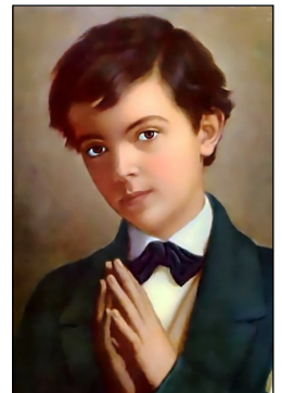
Feast Day: March 9

Born into a peasant family in Italy, Dominic joined Saint John Bosco as a student at the Oratory in Turin at the age of 12. He impressed Don Bosco with his desire to be a priest and to help him in his work with neglected boys. A peacemaker and an organizer, young Dominic founded a group he called the Company of the Immaculate Conception which aided John Bosco with the boys and with manual work. In 1859, all the members—except for Dominic—would join Don Bosco in the beginnings of his Salesian congregation. By that time, Dominic had been called home to heaven. As a youth, Dominic spent hours rapt in prayer. His raptures he called "my distractions." Even in play, he said that at times, "It seems heaven is opening just above me. I am afraid I may say or do something that will make the other boys laugh." Dominic would say, "I can't do big things. But I want all I do, even the smallest thing, to be for the greater glory of God."