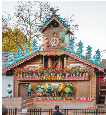
World's Largest Cuckoo Clock