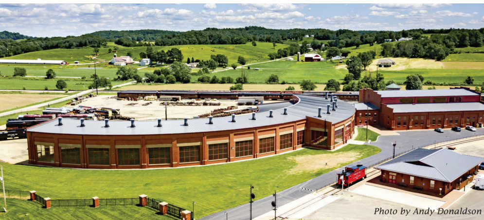
Age of Steam Roundhouse

Join us for a busy week of beautiful backroad driving, history, entertainment, arts, antiques, ICE CREAM, youth activities, and more. We hope you can join us in T County, Ohio, in 2020!