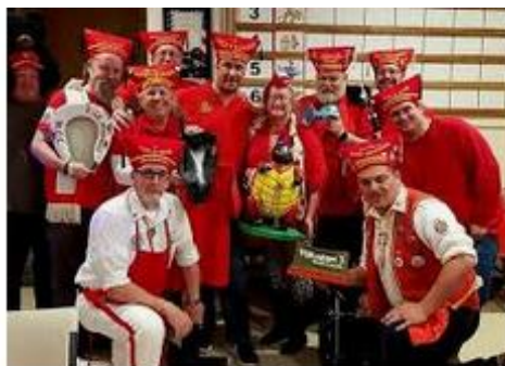
VFW Post 2224