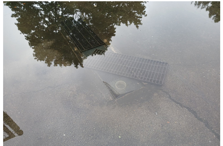
8 inches under water 16 hours after the rain