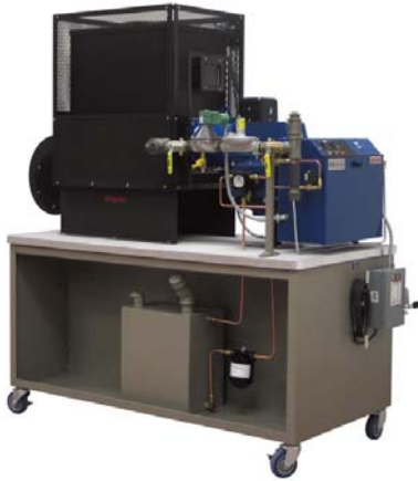
MODEL H-OBDD-3 Mobile Dual-Fueled Burner Demonstrator Dimensions: 95¼"H x 60"W x 30"D (Shown without oil tank)