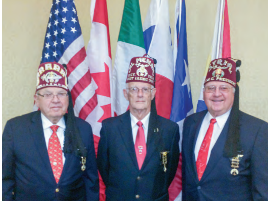
Past Officers attending the 2017 Mid-Winter Meeting in Colonial Williamsburg, VA