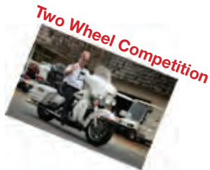
Two Wheel Competition