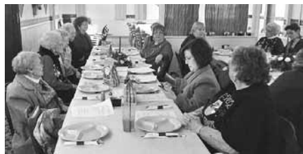
NCW, Unit 21's Christmas party.

Unit #21 (OH) – North Coast WAVES closed out the year with a Christmas Party with quite a few in attendance!