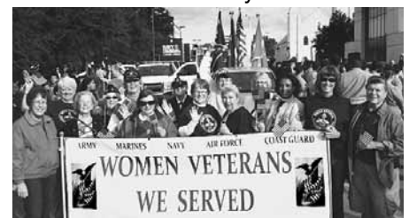
NWFL, Unit 52, participated in Pensacola Veterans Day Parade, 2014.

Unit #52 (FL) – We participated in the Pensacola Veterans Day Parade.