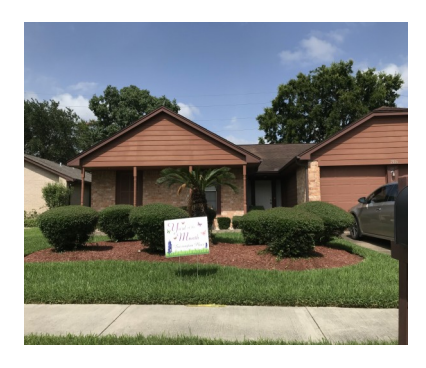
12903 Stancliff Oaks