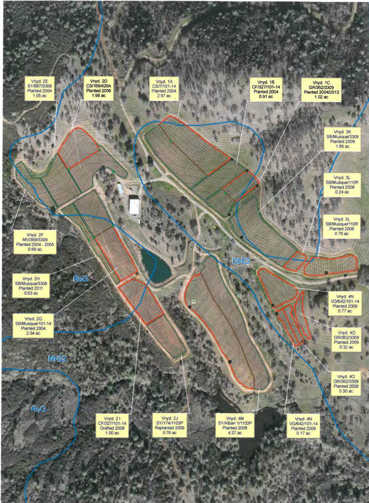
Casey Flat Vineyards