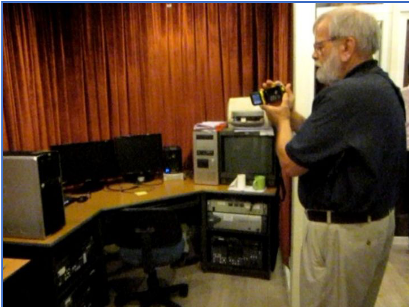
This is video control room #2. The original AFVN studio is behind the curtain.