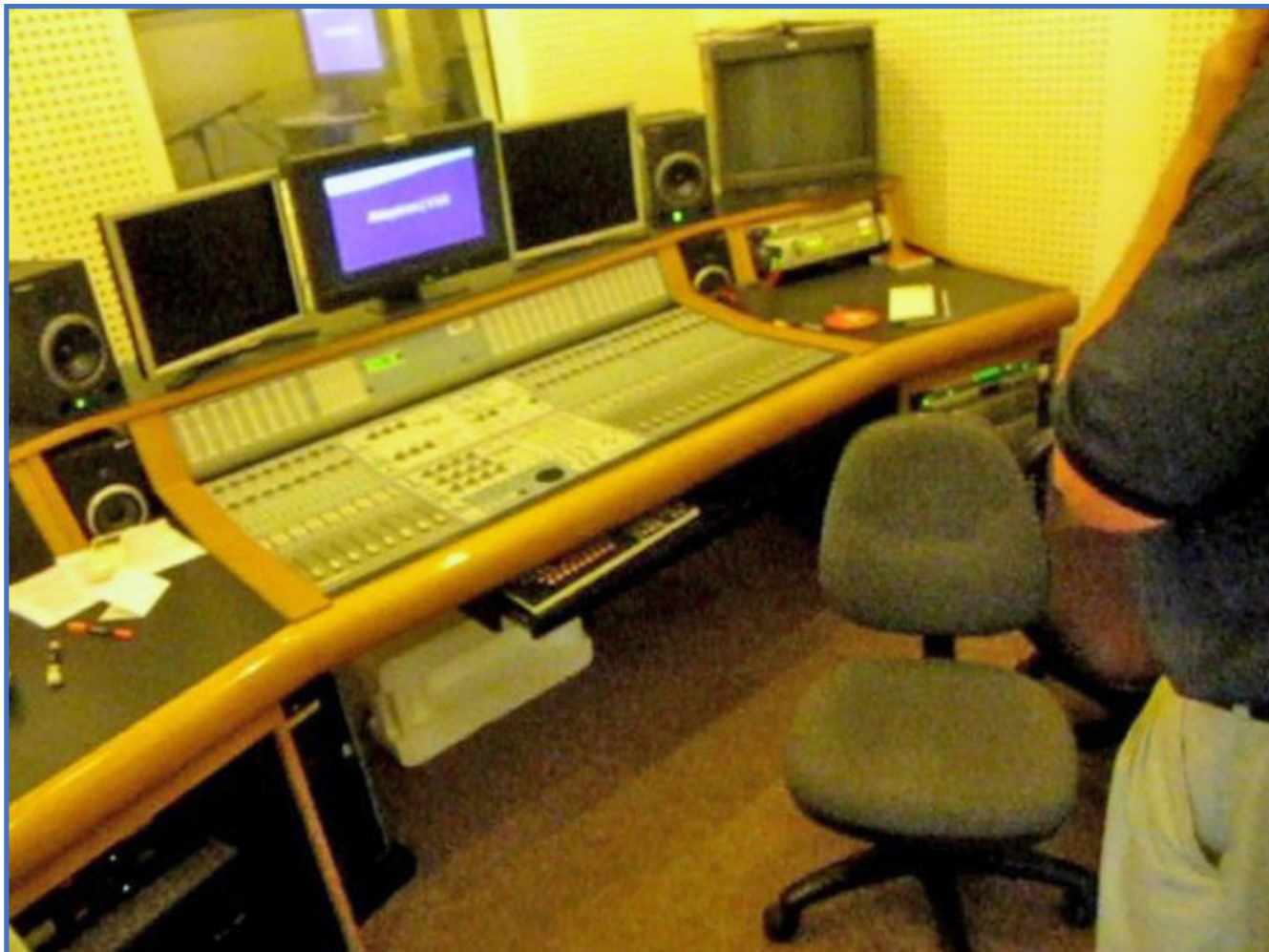
This is video control room #1. The original AFVN studio is behind the curtain.