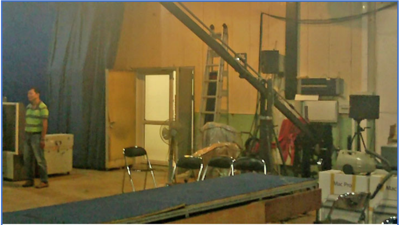
The main studio again.