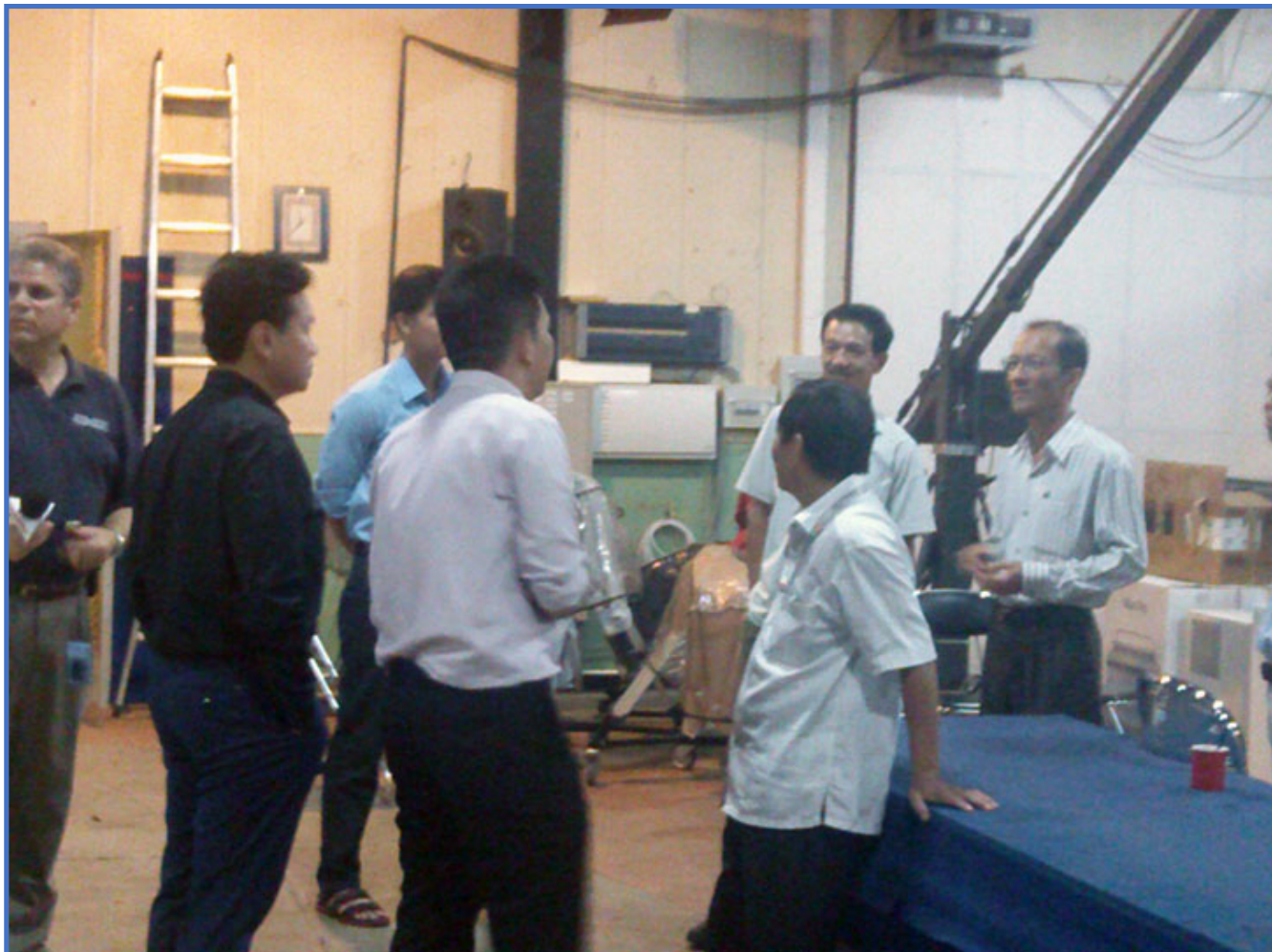
Perhaps the old main studio? It looks more like a storeroom today.