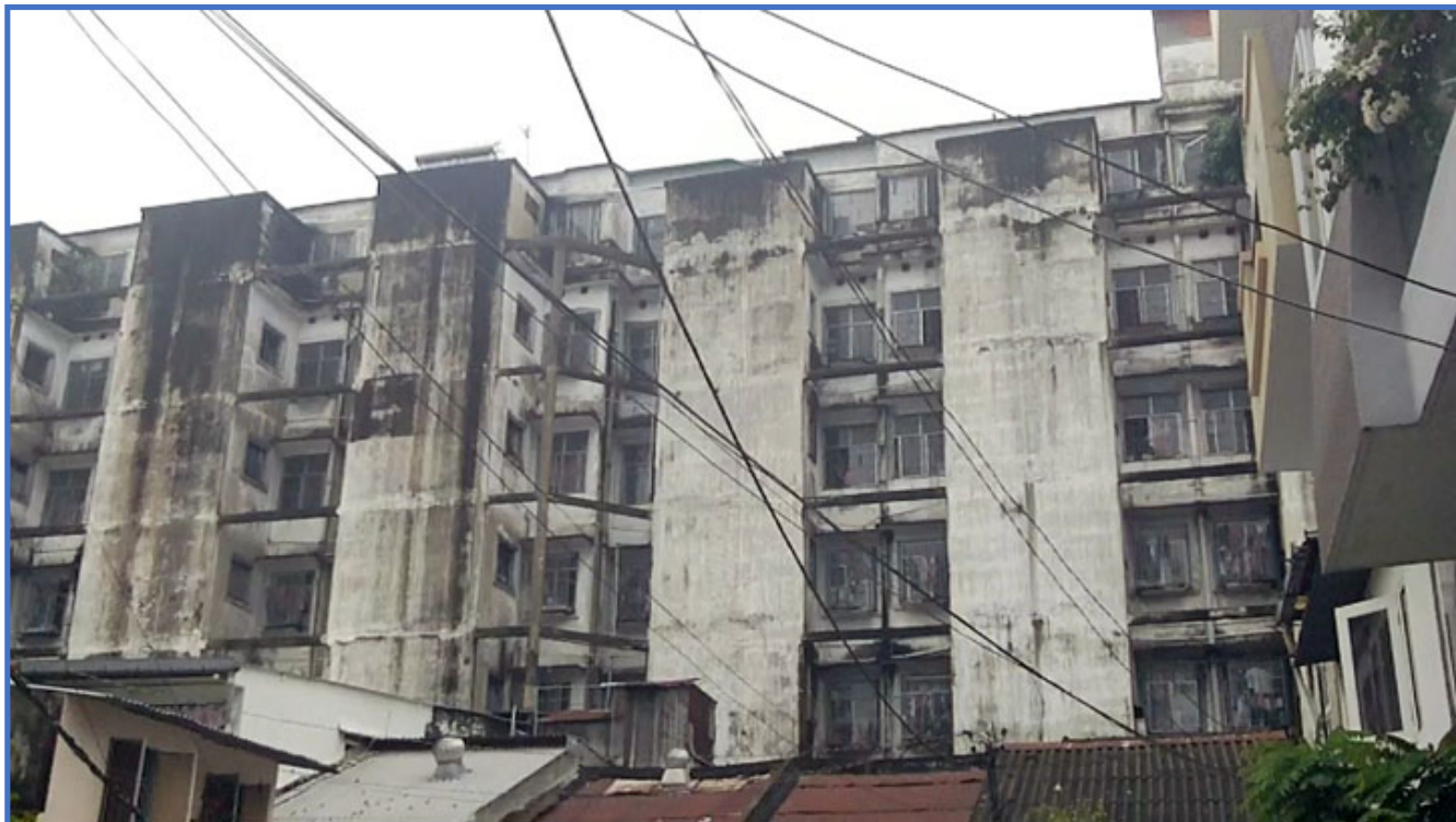
The Plaza Hotel from the alley.