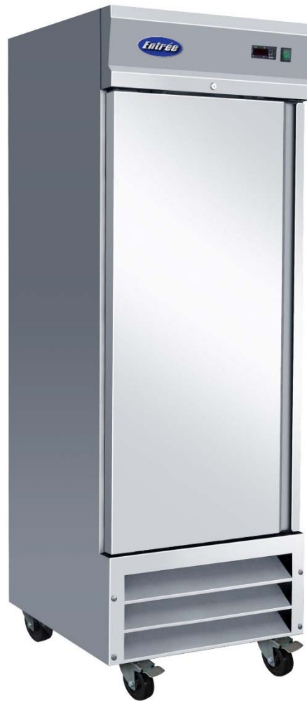
Above picture of CR1-19-HC (R290)