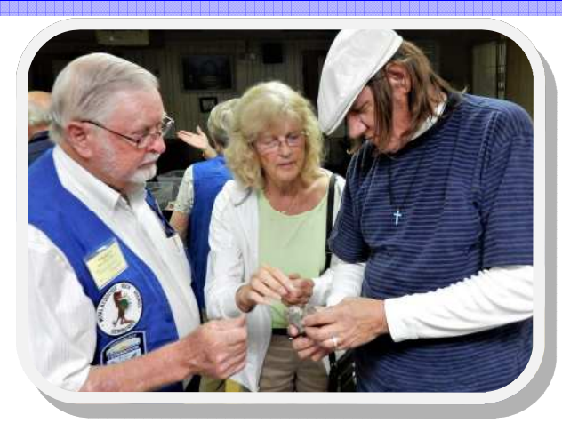
Rovie and Peg checking out a visitor's specimens.