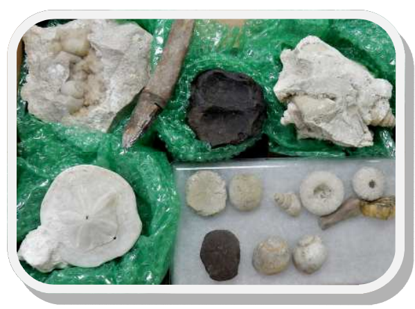
Specimens found at the Vulcan Mine