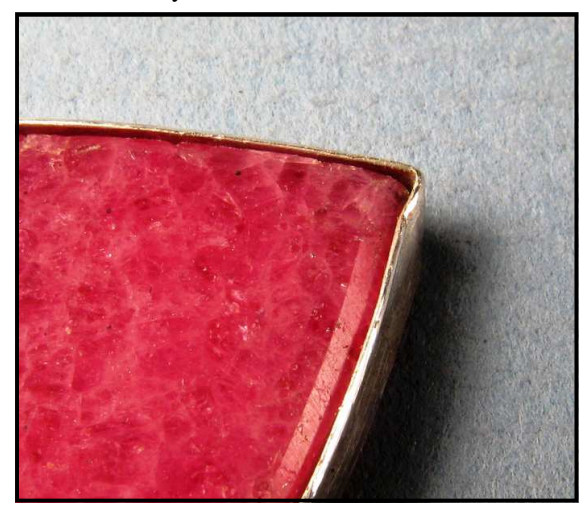
If you want a smooth bezel all around the corners, the simple solution is to set the corners of the

In order for a bezel to capture the stone, the top edge of the bezel must be compressed and become shorter, so it can laydown onto the stone. With a round or oval stone this naturally happens as you push and burnish the bezel. But when setting a stone with corners, the tendency is to push the long sides of the bezel down first. No compression occurs along the sides, and all excess metal is left at the corners. Compressing everything there is difficult. Often the only way to remove the extra metal at the corner is to make a saw cut and fold the two sides in, so they touch.