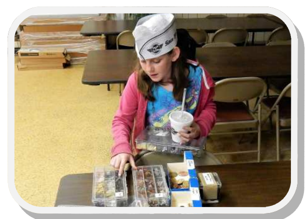
Our youngest member