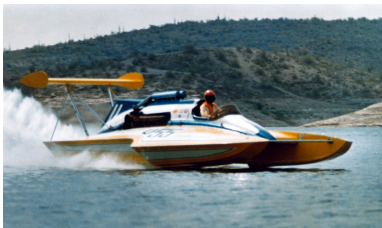
Media promo photo