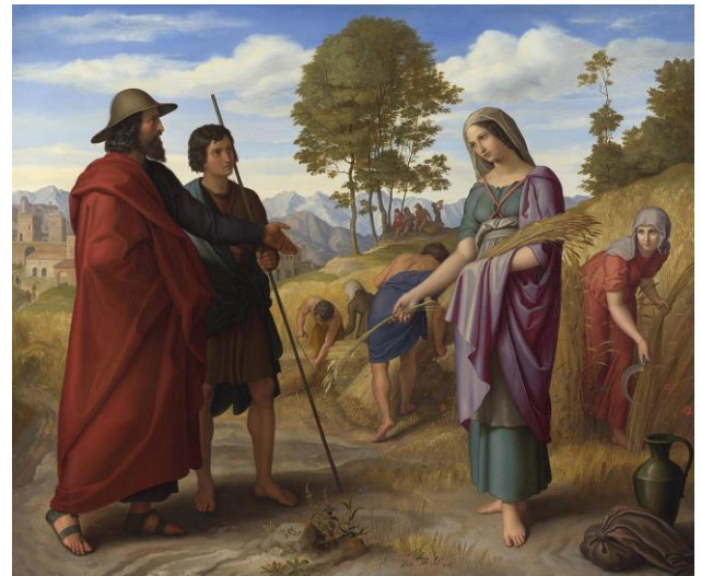
Ruth in Boaz's Field by Julius Schnorr von Carolsfeld Oil on canvas, 1828 National Gallery, London