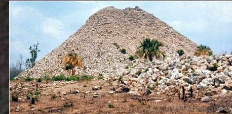
Temple of Columns