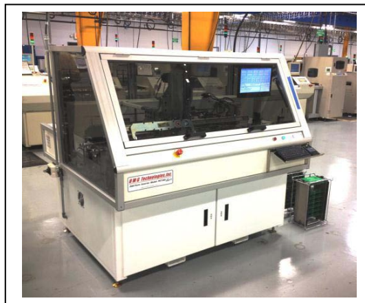
Photo: PLT-902 Base System with Single Head