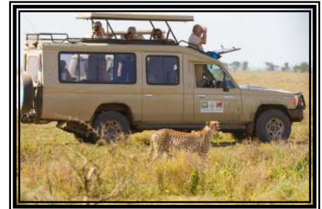
Safari Cruiser with Cheetah