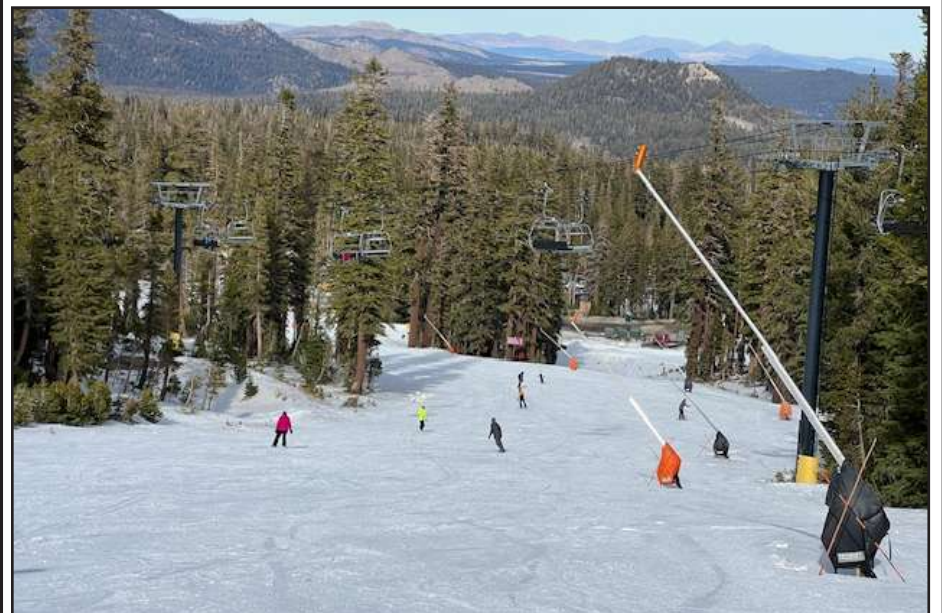
Sigrid checks out the conditions at Mammoth in December.