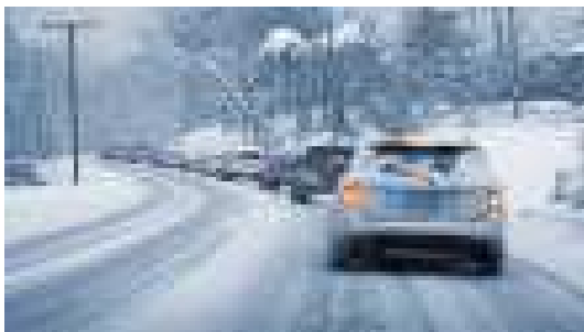
Winter Cometh - Dec 21st

Join CTCI now if you haven't yet. The Early Bird magazine alone is worth the dues.