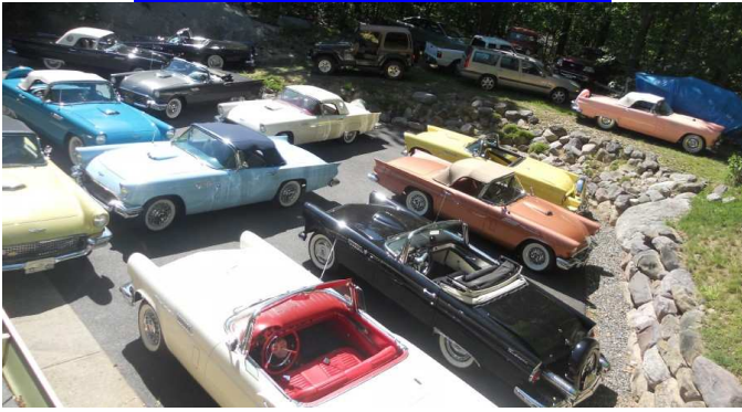
Tune Up Clinic-wall to wall Tbirds