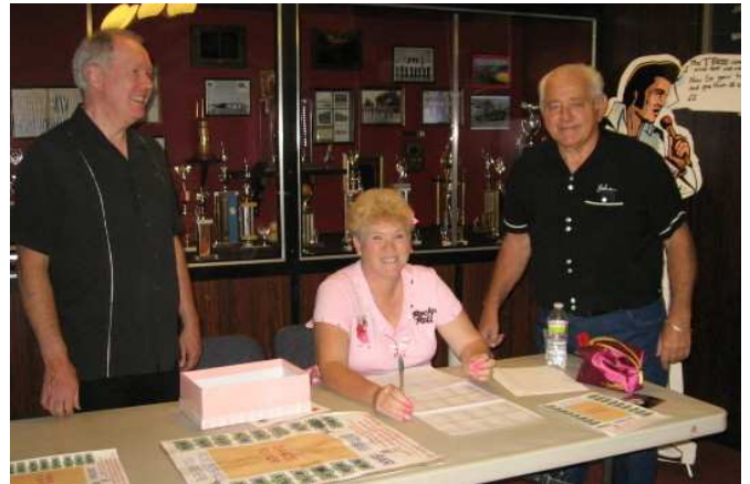
The Dance - tickets please

I always take life with a grain of salt, plus a slice of lemon, and a shot of tequila