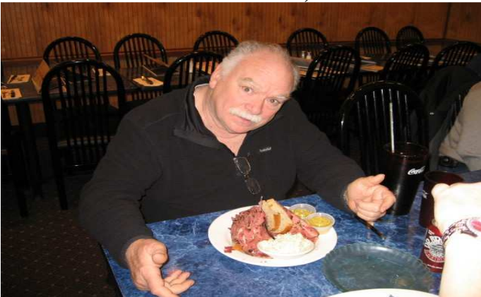
Wadda mean I can't handle this?

December 13th is National Ice Cream Day . So Joe and Rich, go indulge yourself. And for you chocolate lovers, Dec 16th is National Chocolate Covered Anything Day . So feel free to celebrate. Also, Dec 24 is National Chocolate Day so you are doubly blessed this month