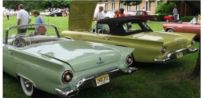
All Tbird Show