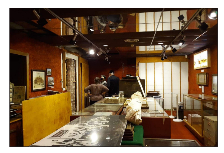
We received a donation specifically to update this room. This picture was taken as we began the work in the Corn Palace Room.