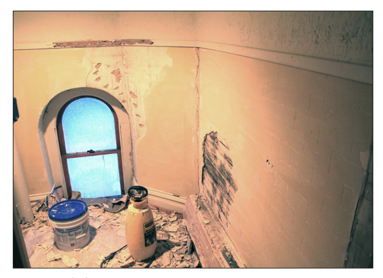
We haven't forgotten the bathroom. This room has received a new coat of repairs, paint and a little tweaking to hopefully accommodate a wheel chair. It is not completely done yet.