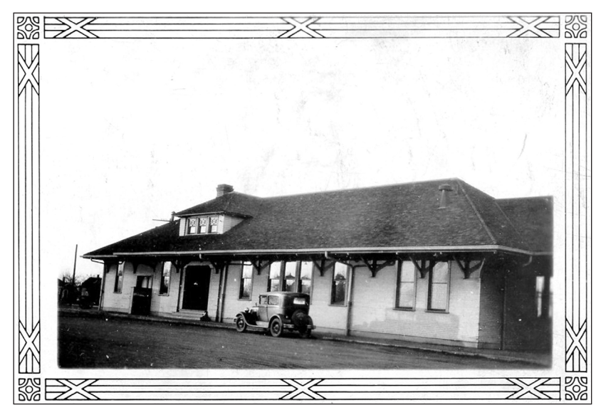
The rail line was first known as the Chicago, St. Paul, Minneapolis, and Omaha Railroad that came to Mitchell, SD in 1887. The name was later changed to Chicago & North Western Line. They also had a freight depot, a car repair facility, several mechanics, coach cleaners and a coaling facility with two coal handlers. This passenger depot was built in 1905 and razed in 1964. Mitchell's service was ended in 1972.