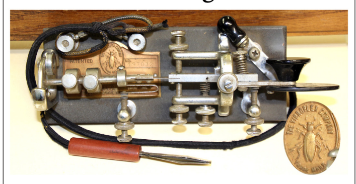
I. J. Carey's Vibroplex "BUG" Around 1908, telegraphers nicknamed these instruments "bugs" because they frequently sounded like one on a circuit. The Vibroplex Company adopted the bug as its trademark when it released its first keys for sale in 1905.