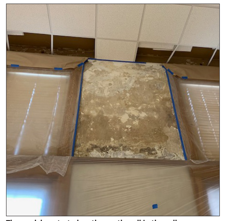
The work has started on the south wall in the gallery.

These pictures are during the process of repairing the walls in the Gallery (also known as the area we have programs)