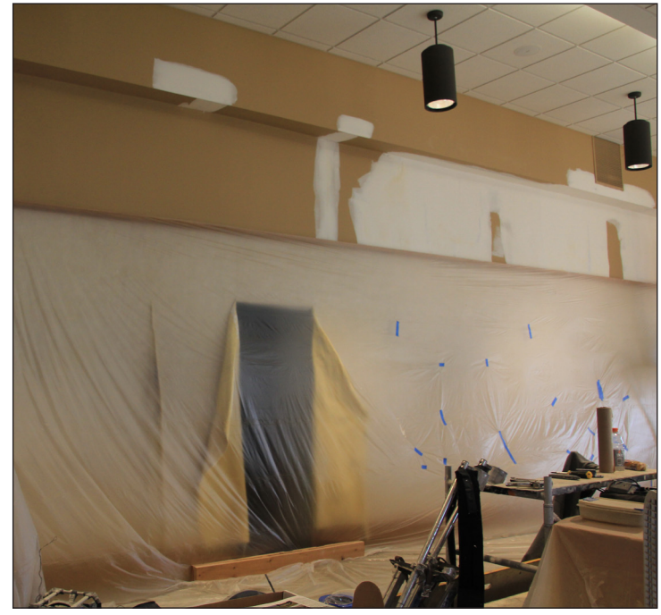
Gallery east wall – Ready for painting.