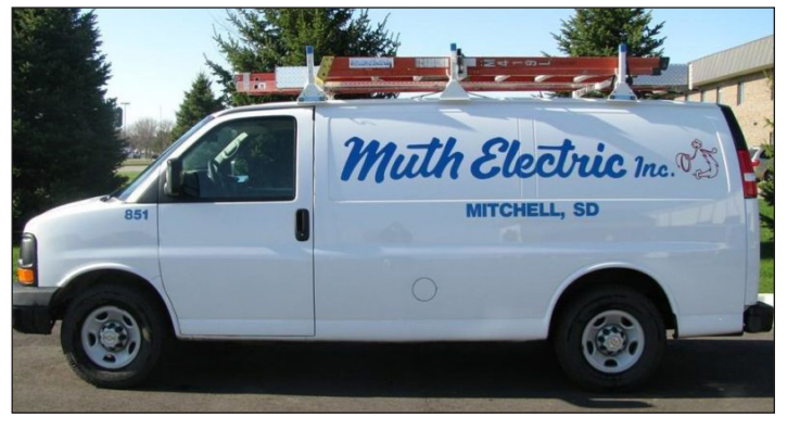
Muth Electric installed new ceiling lights and additional outlets in our Corn Palace Room.