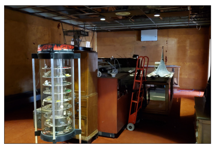
We removed the orange shag carpet from the wall. We will be replacing it with something lighter in color.