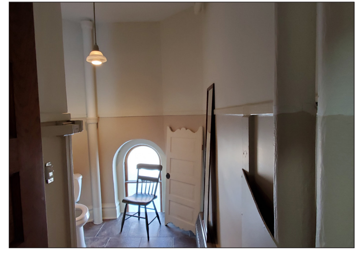
Bathroom is repainted.