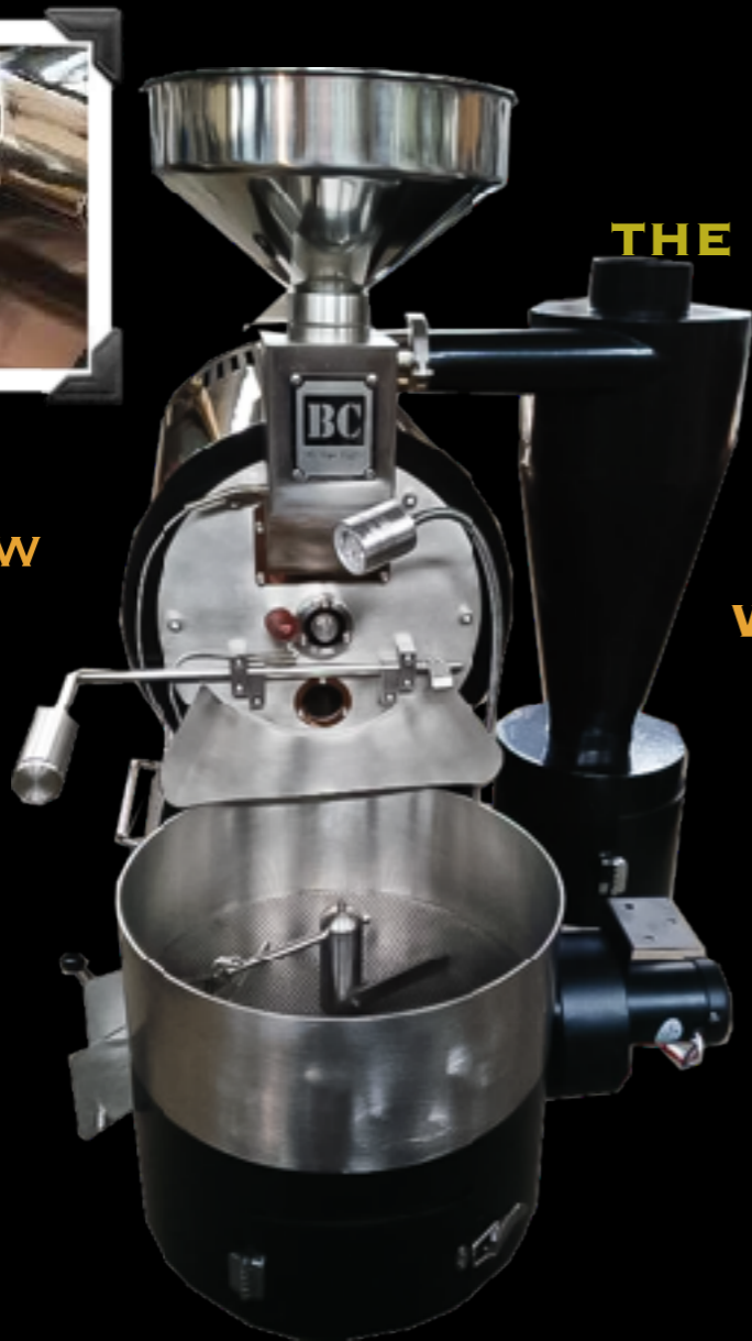
ALL NEW MDDS AIRFLOW

BUCKEYECOFFEE.COM 623.332.1360 INFO@BUCKEYECOFFEE.COM