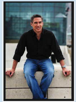
Brad Taylor Action Thriller