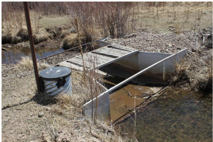
Flume looking downstream