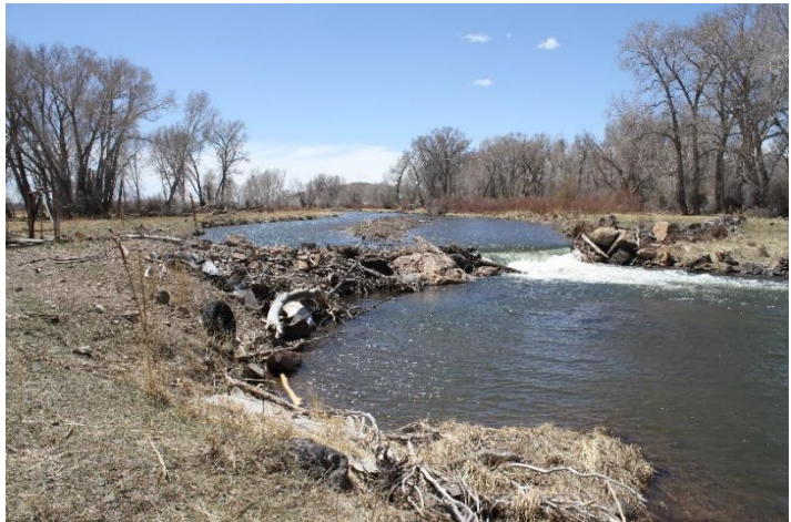
Diversion dam looking upstream