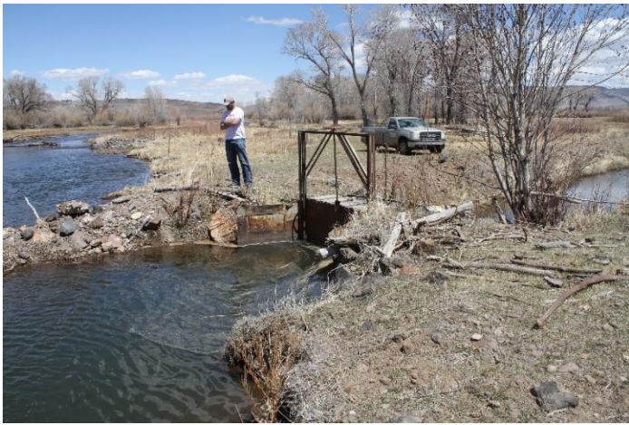
Headgate looking downstream