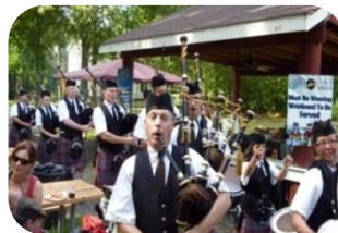
Pipes & Drums