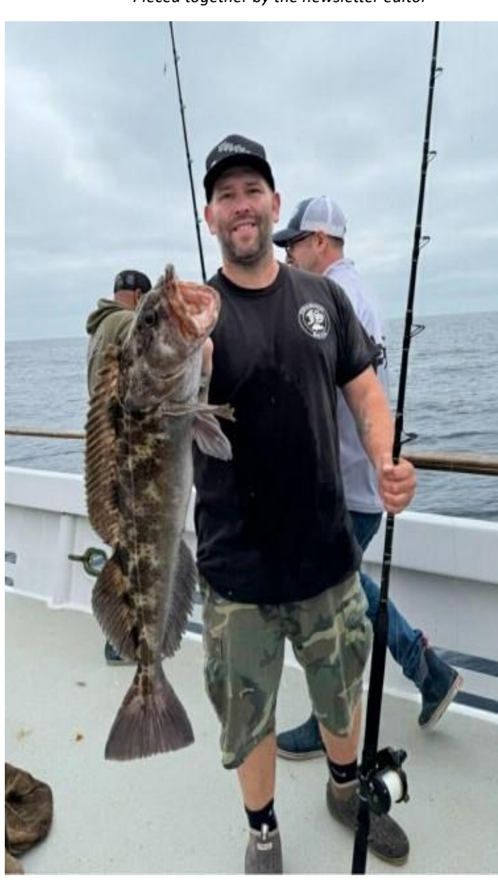
Pieced together by the newsletter editor

I couldn't find a total fish count for the trip, maybe someone will have it at the meeting.