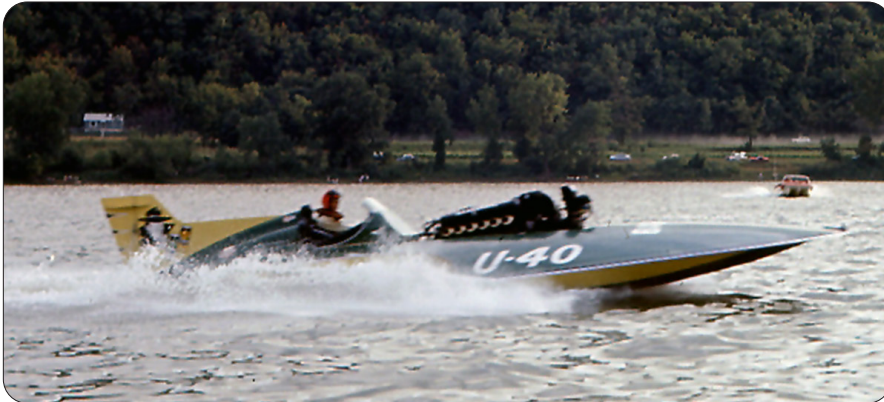
TOP: Puffs of black smoke shoot from the stacks of both Bardahl and Exide as their drivers apply nitrous oxide to the engines. ABOVE: Miss Bardahl in Madison, Indiana.