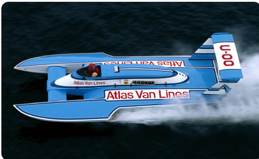
Hydroplane and Raceboat Museum

Perhaps Muncey was going too fast to make the next turn? Perhaps he couldn't see it? Whatever the reason, a camera operator who was filming the race from the shore saw the event unfold