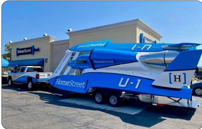
San Diego Bayfair

After having the Miss HomeStreet display hull out in the Seattle area last month to help promote Seafair community events, the display boat headed to San Diego (below) in advance of the H1 fleet. The hull went on display at HomeStreet Bank branches around the Mission Bay area and in San Diego County.