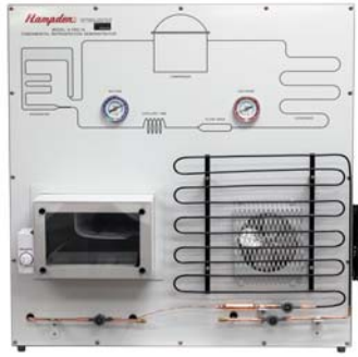
MODEL H-FRD-1A Dimensions: 36"H x 36"W x 13"D Shipping Weight: 272 lbs