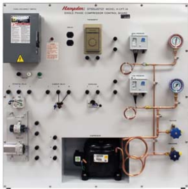
MODEL H-CPT-1A Dimensions: 36"H x 36"W x 13"D Shipping Weight: 260 lbs